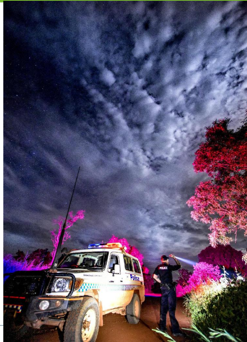
Photo: “ Searching for answers to prevent elder abuse ” by Constable Will Healy based at Bamaga Winner: 2017 World Elder Abuse Awareness Day photo competition run by EAPU